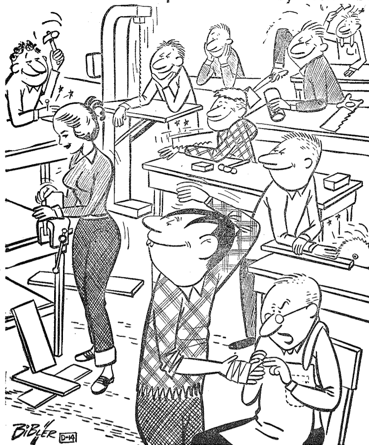
"Boy, we're sure havin' a lot of shop accidents this year."