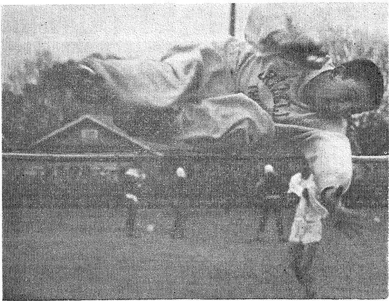
• UP AND OVER—Jarrell Williams, sophomore, takes the side view as he high jumps during the dual track meet with Mena staged Friday in Grizzly Stadium. The Grizzlies won the meet 112-2.